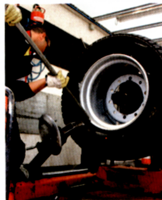
Truck Point fits the super wide base Greatec Megadrive (GMD) with the Aircept run-flat system at the location of the fleet operator. The Greatec replaces the twin tyres on the driving axle.

favour of its introduction, as many fleet have recognized the advantages. The system functions by several steps. When the vehicle of a fleet, which has a supply agreement with Bridgestone, comes to the yard, the tyre dealer examines the state the tyres on the vehicle are in and after a glance into the agreement the fleet operator has been able to arrange according to his individual requirements, the dealer knows the type of service, which products to supply and which procedure to pursue in this case. After that he carries out all necessary work on the vehicle, which is documented in the form provided for the vehicle check. Bridgestone examines the entries, makes out the account and sends it to the local dealer, who passes it on to the fleet operator in question. The advantage for the fleet operator is that all his drivers are served at all Truck Point Service-stations according to uniform standards and a service fixed beforehand. In addition, there is only one central partner, who can be addressed in regard to the invoice.